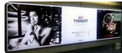
Light box advertising