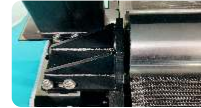
One-press pneumatic shaft controller, for straight and flat media feeding, with ease of use and maintenance.