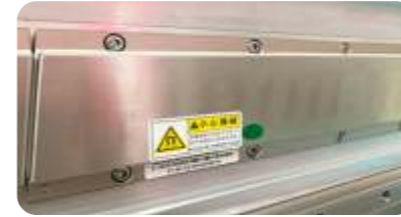
Power linear motor.