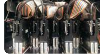
Reinforced carriage plate for multiple combinations of different color matches.