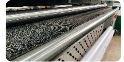
Strengthful chrome plated shaft, to secure the feeding of media straight and flat, for better print output.